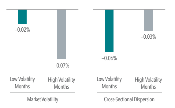
Exhibit 1: Average Excess Monthly Returns for Active US Equity Mutual Funds, 1/1999–12/2019

bills after market downturns of various magnitude and switch back to US stocks following different lengths of time out of the market. Compared to the market's long-term annualized return of 9.57%, nearly all of the timing strategies underperform the simple buy-and-hold strategy.